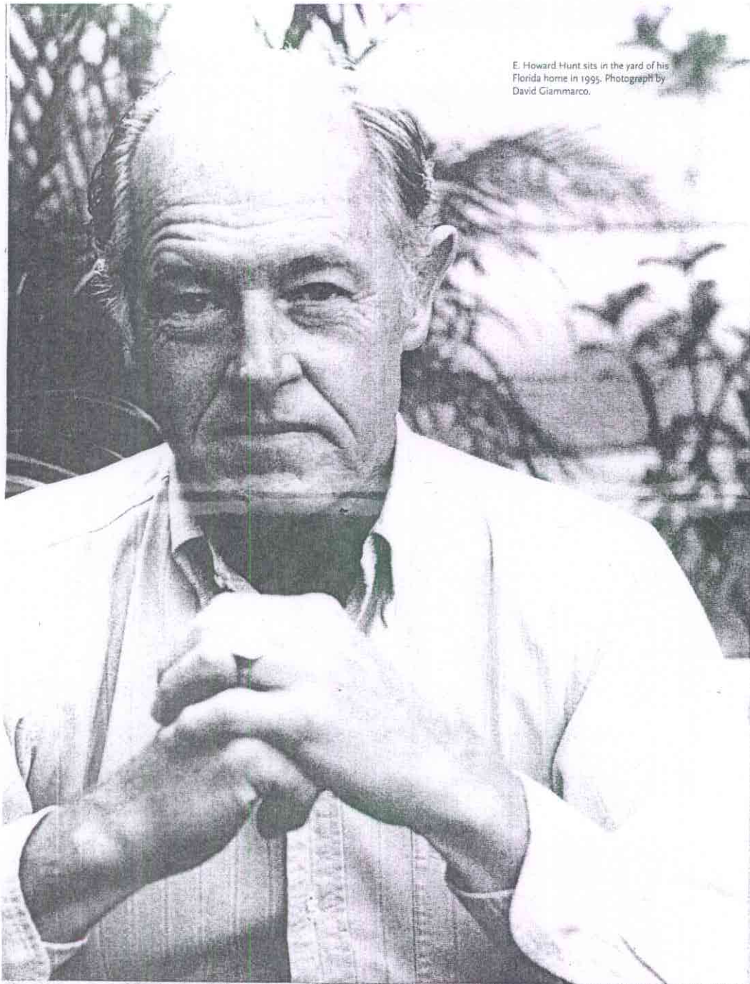
E. Howard Hunt sits in the yard of his Florida home in 1995.